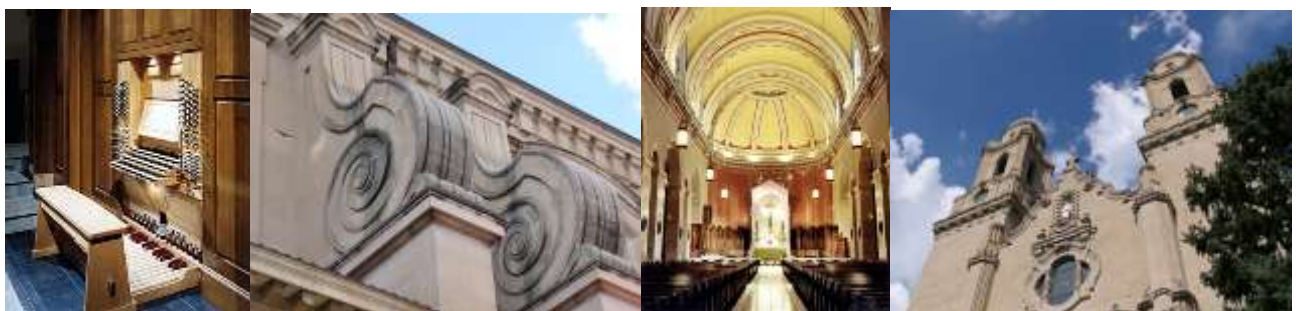
Exterior pictures courtesy of © Catchpenny, used with permission.

Five organs on campus, including instruments by Bedient (2), Holtkamp and Wissinger Permanent Collection of 17 th Century Spanish Colonial Art Spanish Renaissance Revival architecture of Saint Cecilia Cathedral Youth Outreach through the Saint Cecilia Organ Academy and the Omaha Conservatory Exploration of the Kenneth Bé Collection of Lutes, Manuscripts and Facsimiles